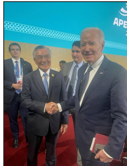
Image: Taiwan’s representative to the 2024 APEC summit, Lin Hsin-yi, exchanges greetings with US President Joe Biden (foreground) and Canadian Prime Minister Justin Trudeau (background) at the APEC Summit in Lima, Peru in November 2024.

Students of Taiwan’s diplomacy may be further surprised to see divisions within APEC, wherein Taiwan and People’s Republic of China (PRC) delegates hold equal status with identical bureaucratic powers. The unique diplomatic opportunities bestowed by APEC have led Taiwan’s former president Tsai Ing-wen (蔡英文) to describe the organization as “Taiwan’s most important international platform.” Indeed, in a world where Taipei is steadily losing official diplomatic partners, APEC stands as an organization where Taiwan is able to officially engage with foreign governments with only cosmetic restrictions (such as a requirement to participate under the title “Chinese Taipei”). Given its objective of supporting Taiwan’s internationalization, the United States should throw its weight behind APEC, and expand its budget and status to facilitate Taiwan’s multilateral diplomacy.