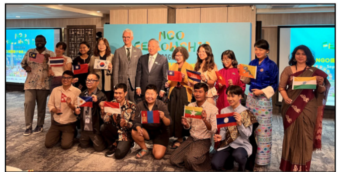
Image: Recipients of grants through the NGO Fellowship Program, jointly funded by the American Institute in Taiwan and Taiwan's Ministry of Foreign Affairs, pose with the flags of their countries in a group photo (September 30, 2024). AIT Deputy Director Jeremy Cornforth and MOFA Vice Minister Remus Li-Kuo Chen (陳立國) are also present in the photo (back row, middle).

In this pilot program, the ten fellows (selected from a list of 172 applicants) came from NGOs that pursue efforts in a range of areas: to include assisting remote villages in building sustainable agricultural systems and educational facilities, providing vocational training for persons with disabilities, menstrual hygiene management training for adolescent girls, and advocacy work for the rights of women and those suffering from HIV/AIDS. In this process, the program also sought to build connections between Taiwan and regional NGOs as well as to help create a support network among NGOs in Asia.