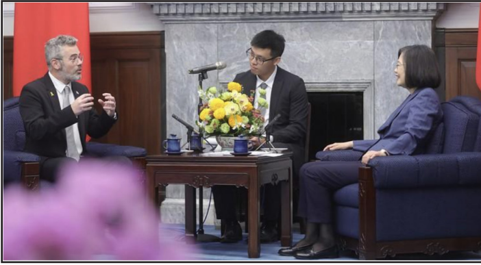
Image: Then-ROC President Tsai Ing-wen speaking with Israeli Knesset Member Boaz Toporovsky, the leader of a delegation from the “Knesset Taiwan Friendship Group” visiting Taipei (April 15, 2024). In the meeting, Tsai thanked the delegation “for demonstrating your support for Taiwan,” and for promoting cooperation in areas such as education, public health, and tourism.

Because of their pariah status, this “alliance of the shunned” (or “fourth world”) stuck together on issues such as nuclear weapons development: From the late 1970s, a triangular relationship emerged between Taiwan, Israel, and South Africa, with Pretoria providing uranium, Taiwanese scientists enriching it to weapons-grade levels, and Israeli engineers offering rocket technology. [1]